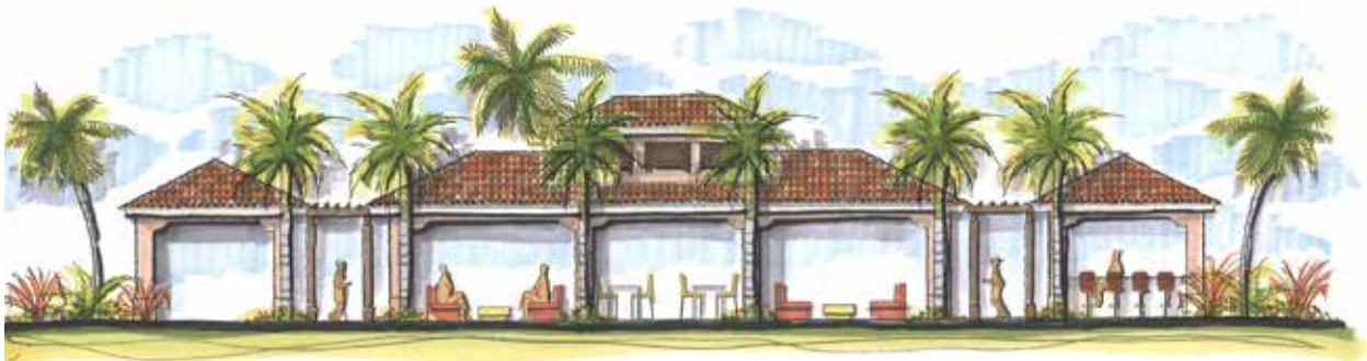
Pavillion Front Elevation