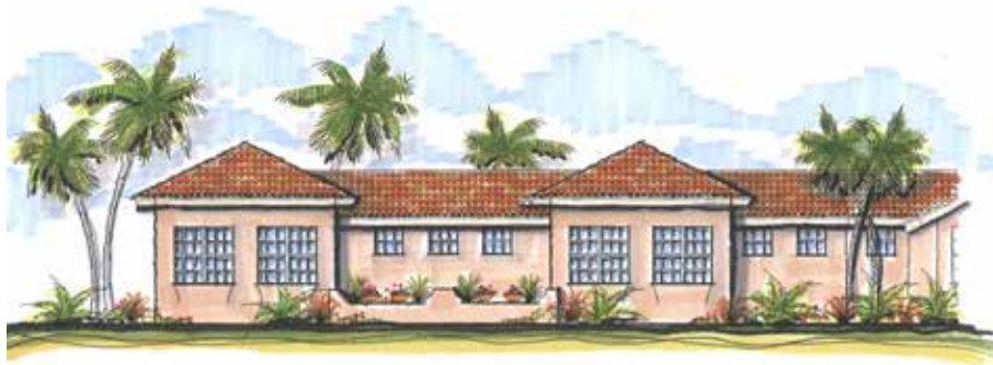
Fitness Front Elevation

presentation of Financial Scenarios for plan A and B, noting anticipated project costs, at this time. Monthly and quarterly maintenance charge increases for either plan A and B were deemed affordable for owners. After a question period, a hand vote was taken of owners, with 45 of 48, on September 1, favoring plan B and 35 of 38 on September 2, favoring plan B ... 93% of those attending. It was expected that with major planning steps still to be completed, renovation could take up to 18 months from now to complete. Following final Board and County approval, it is believed that construction would be initiated in the 1 st quarter of 2016 and be completed by the end of the year.